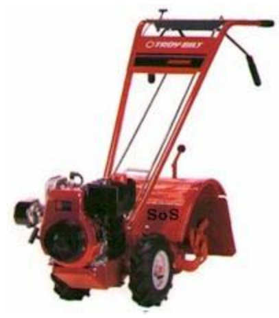
Figure 1. Troy-Bilt Tiller

You will need to purchase the following: